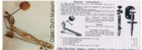
The "Relax" Frazer Pedal