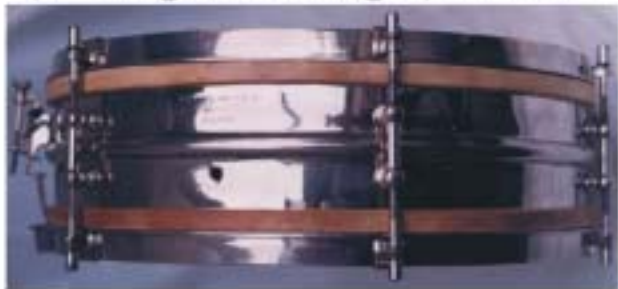
Classic Drum Museum