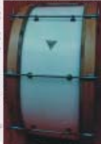
Classic Drum Museum