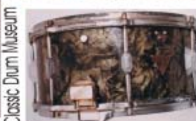
Classic Drum Museum