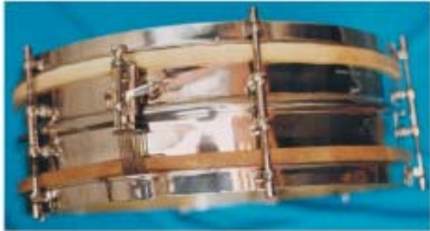
The 5"x15" "supertone" (Ludwig & Ludwig Split Shell)